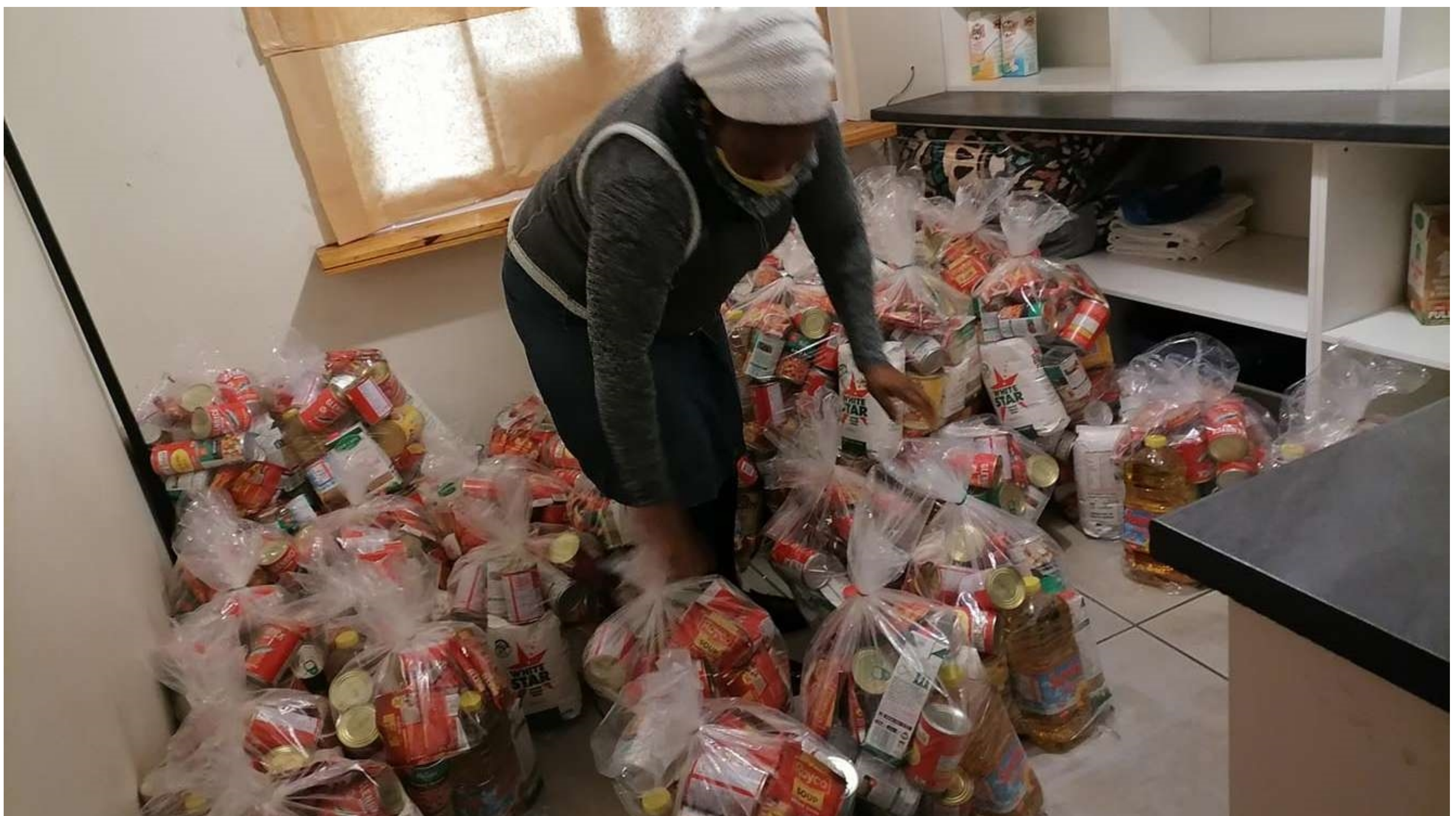
The Care Packages ready to be delivered to the seniors