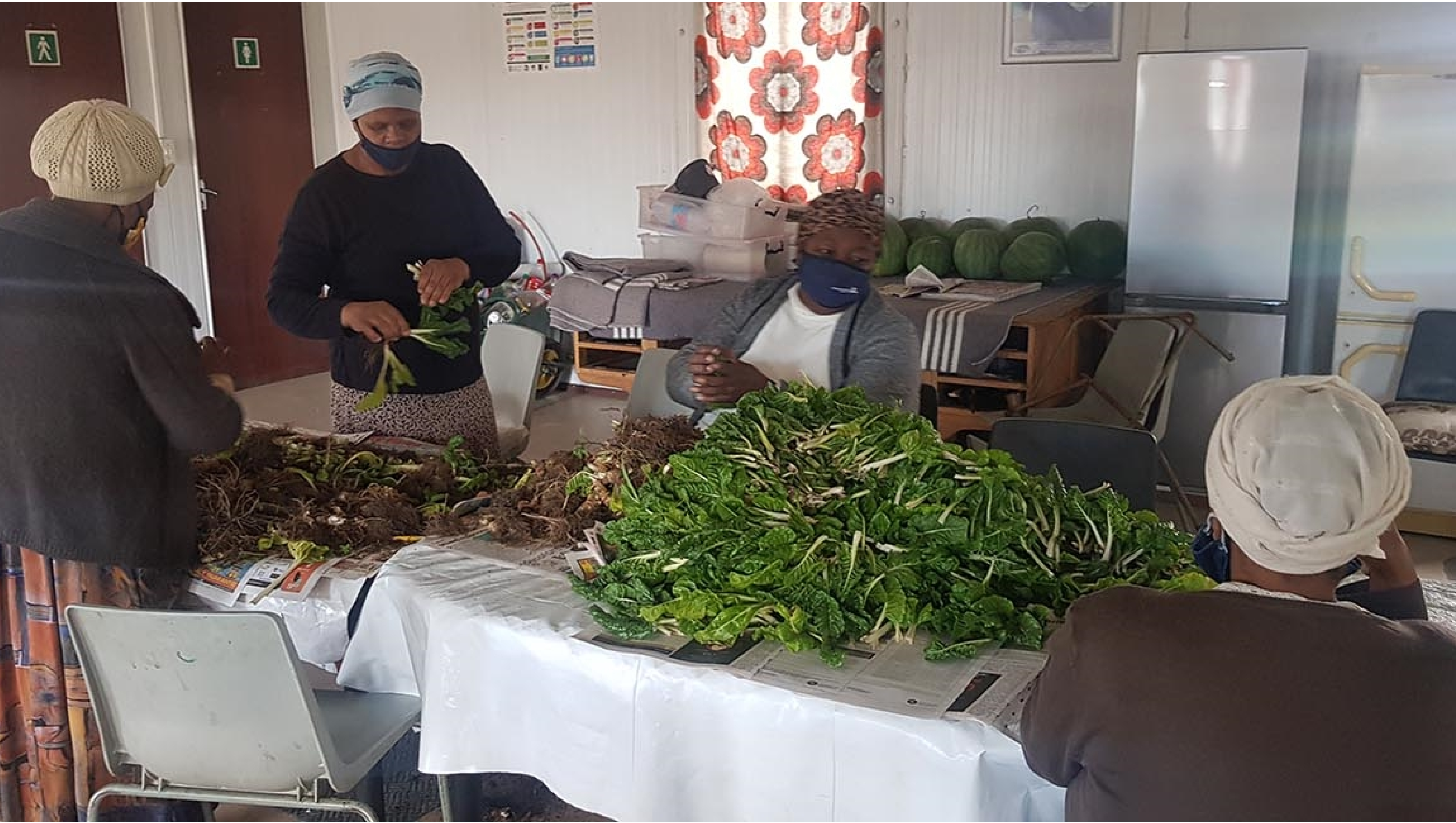
The seniors sorting through the vegetables for delivery to all the seniors at their homes

The centre initiated a support program to distribute food parcels and gift vouchers to each member of the club so as to supplement their old age grant of R1780 per month. With the help of Ludwe Qamata and Ghetto Gardeners the seniors have been receiving weekly vegetable boxes from their garden containing spinach, beetroot, lettuce and spring onions.