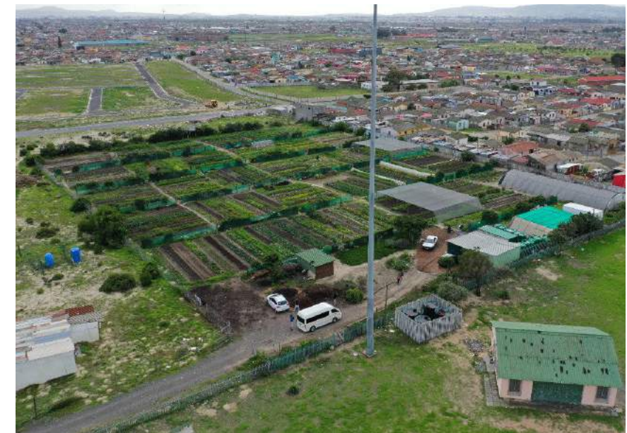
Moya We Khaya Garden from the sky

We are so grateful and appreciative of the relationship with Uthando and are thankful to each and every donor that continues to support them."