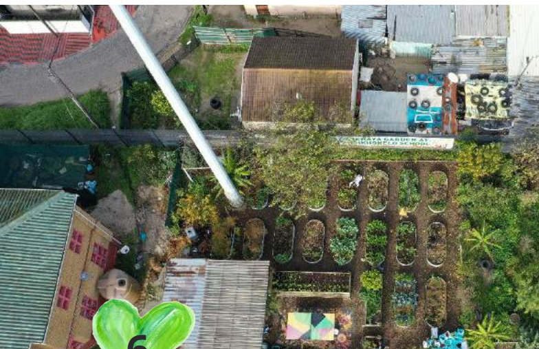
Ikhaya Garden from the sky