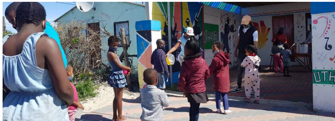
The Isibane se Afrika “home” transformed into a soup kitchen