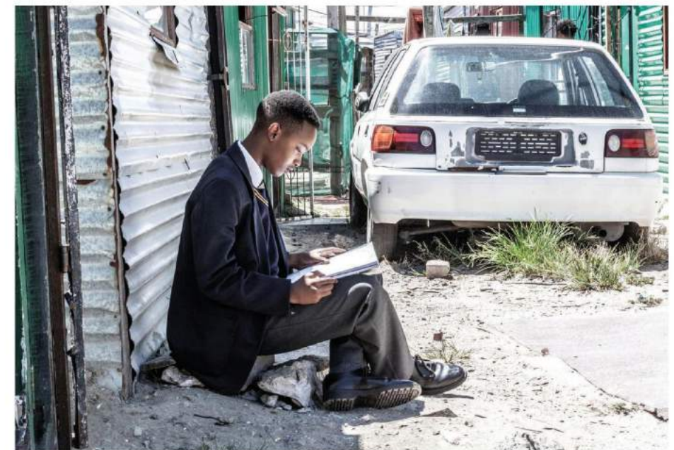
NON-PROFIT school Christel House has raised more than R500 000 to feed 250 families until the end of July.

campaign has been positive with individual donors and businesses from South Africa and around the world managing to raise more than R500 000 to increase its support to over 250 families and for an extended period.