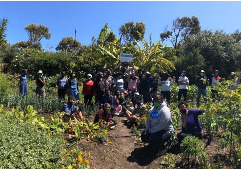
The We Are Africa Team visiting SEED

“SEED is deeply grateful to Uthando for their unwavering support through the crazy year that was 2020. Food poverty in Mitchells Plain was 36% before lockdown and rose alarmingly to 52% as the year progressed and job losses took their toll. Uthando support enabled us to pivot our gardens to support two local feeding schemes - regularly feeding 677 people.”