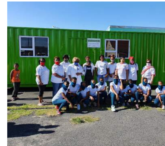
The Alcardo Andrews Foundation Team in front of their brand new kitchen (shipping container) Ikhaya Garden from the sky