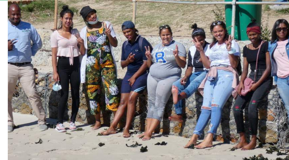
Some of the Girls on an excursion around the Cape Peninsula provided by Uthando