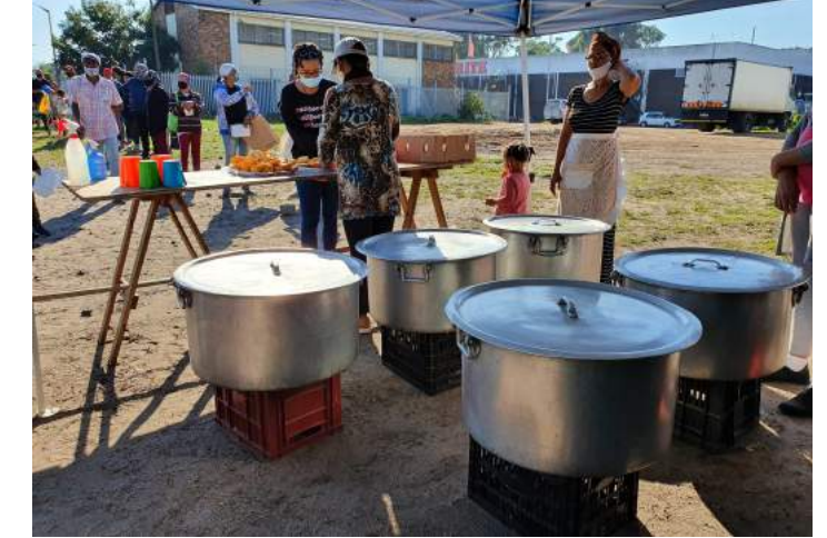
Feeding vulnerable people in Hanover Park is an ongoing challenge