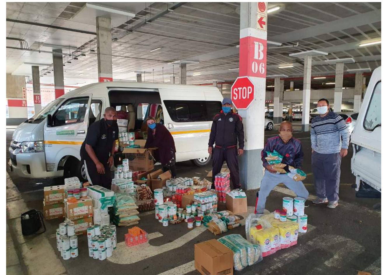
The Hanover Park Cricket Club guys packing the Uthando vehicle with the groceries.

The Uthando Vehicle was transformed from carrying guests to community projects into a work horse delivering food, groceries and other essentials on a daily basis. It was a surreal experience being out on the roads which were largely devoid of traffic and people.