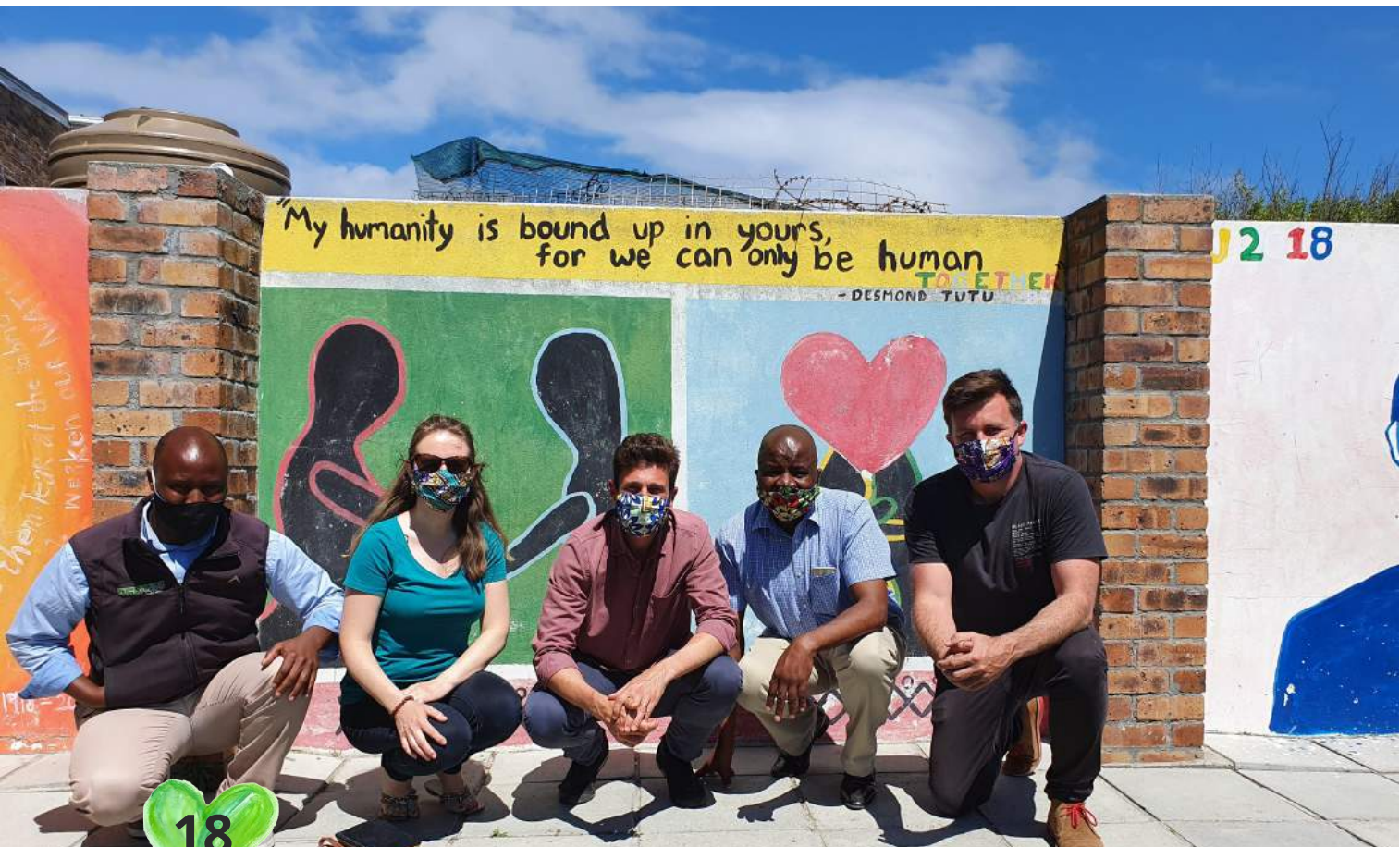
The We Are Africa Team visiting the Nonceba Family Centre

It is just as important to protect, care and nurture vulnerable animals as it is people. Uthando is extremely proud of the passionate and dedicated projects that are concerned with animal welfare and very grateful that we were able to support during this difficult crisis.