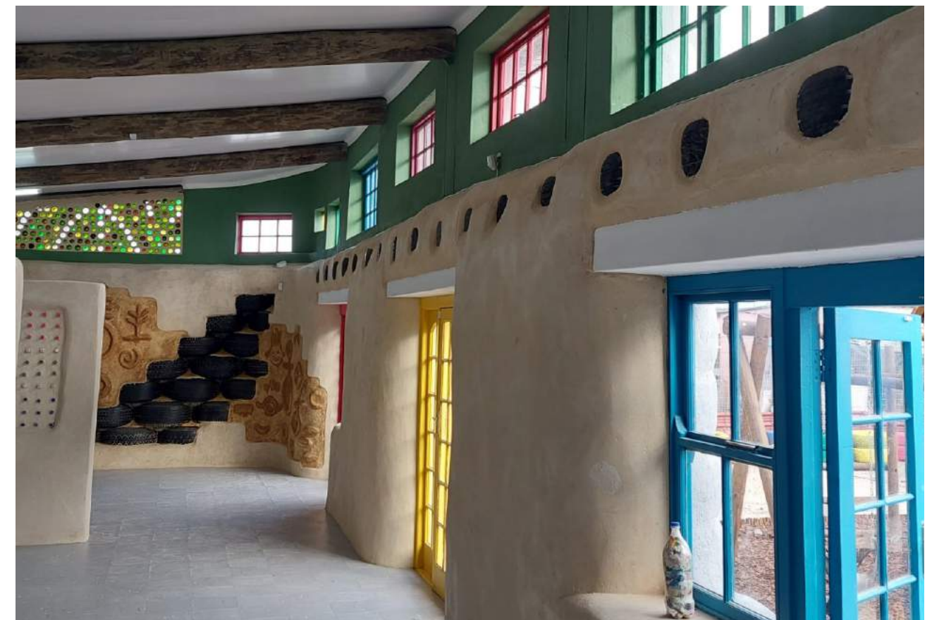
Ulwazi Educare. Tyre wall, natural plasters, recycled doors and windows, glass bottle light bricks and eco bricks