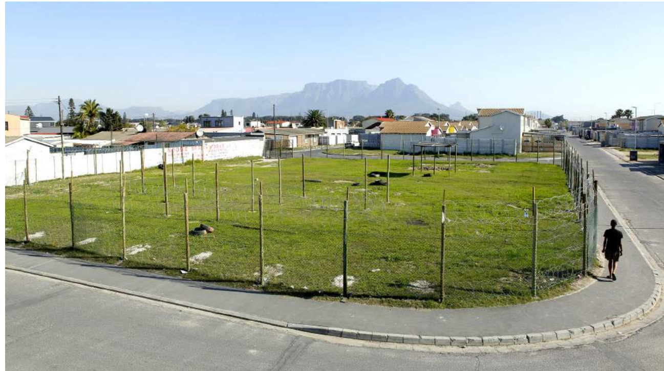
The land on which Goal50 Edu Hub is going to be constructed

There is a significant shortage of ECD Centres within the Heideveld community as many of the guardians and parents do not have the financial capacity, or simply do not appreciate the importance of early childhood development. GCU has established a small creche that is accessible and affordable. A property has been acquired with plans for the development of a multi-classroom Early Childhood Development Centre. In addition to this, facilities for the training of local teachers will be established, enabling the centre to accommodate as many as 200 ECD places, once it is fully operational.