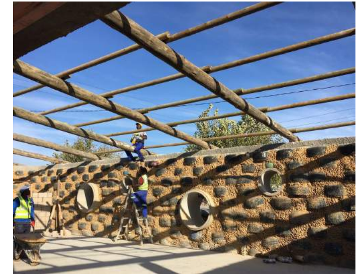
The roof starts going on