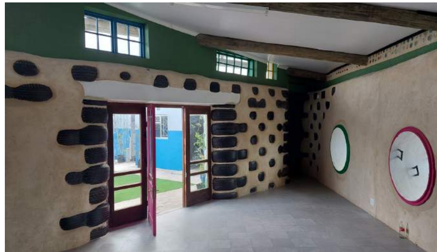
Ulwazi Educare, a place of learning, love and creativity