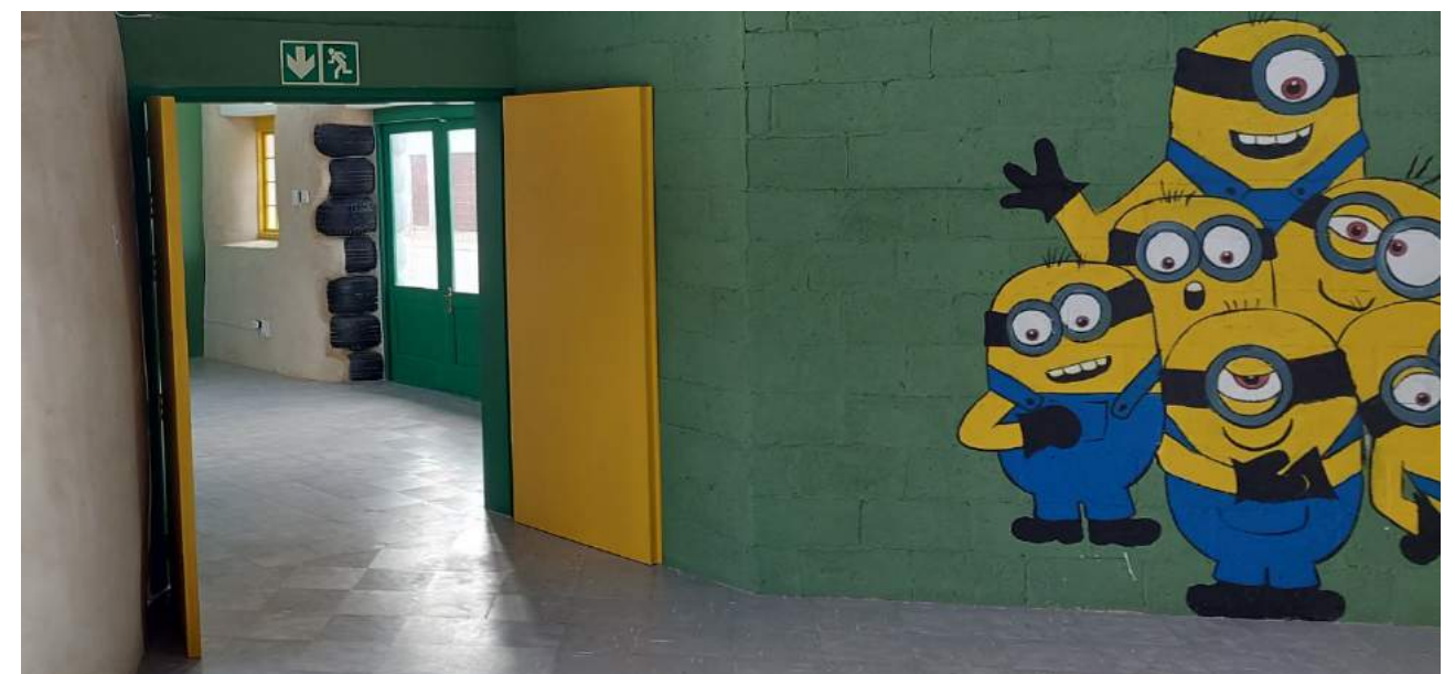
Bricks made by Greenset