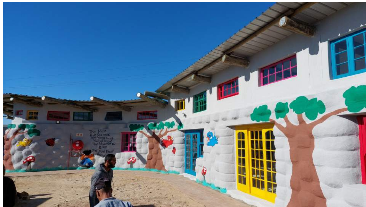
Ulwazi Educare, newly completed tyre wall with recycled doors and windows

It is our firm belief that by implementing the use of sustainable building methods, we can minimise the building industry's contribution to greenhouse gasses, all the while creating a much-needed infrastructure that serves the community on multiple levels.