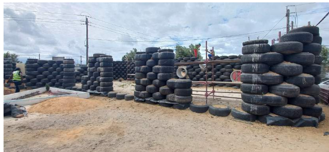
The walls start taking shape