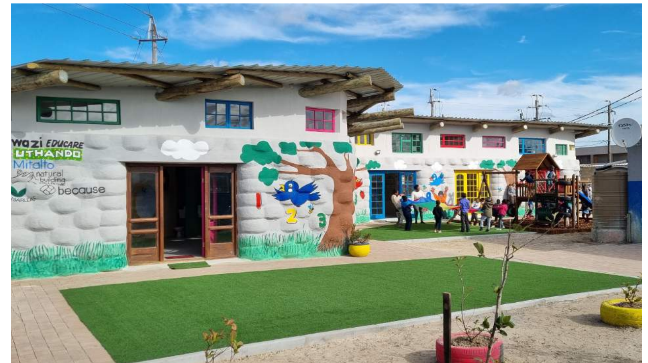
Ulwazi Educare – July 2022

Ulwazi “Knowledge” Educare is one of the most extraordinary and beautiful buildings in South Africa. Constructed out of 1700 tyres, 6000 eco bricks (plastic bottles that have been filled with rubbish) and over 1600 other recyclable materials, the centre is a true labour of love. It is so much more than just a preschool. It is a highly functional piece of art that has become a beacon of hope and an ongoing inspiration to its community. Where young children have been given the opportunity to learn, develop and realise their own dreams.