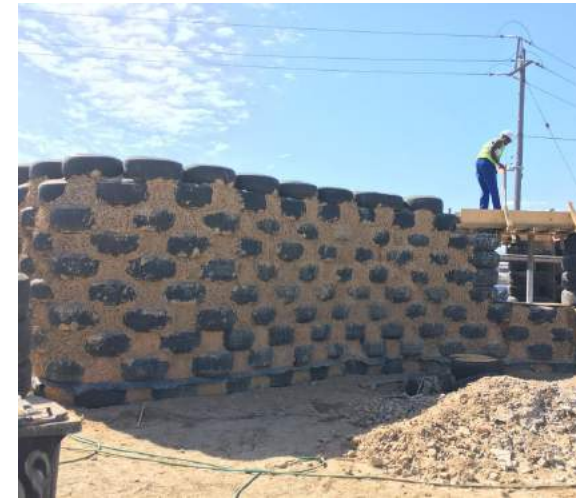
Cobbing being placed on the walls