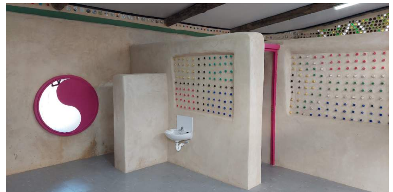
Spot the South African flag made from bottle tops in one of the internal walls