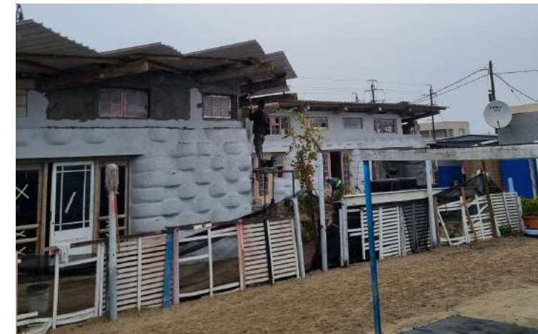
The building starting to really take shape