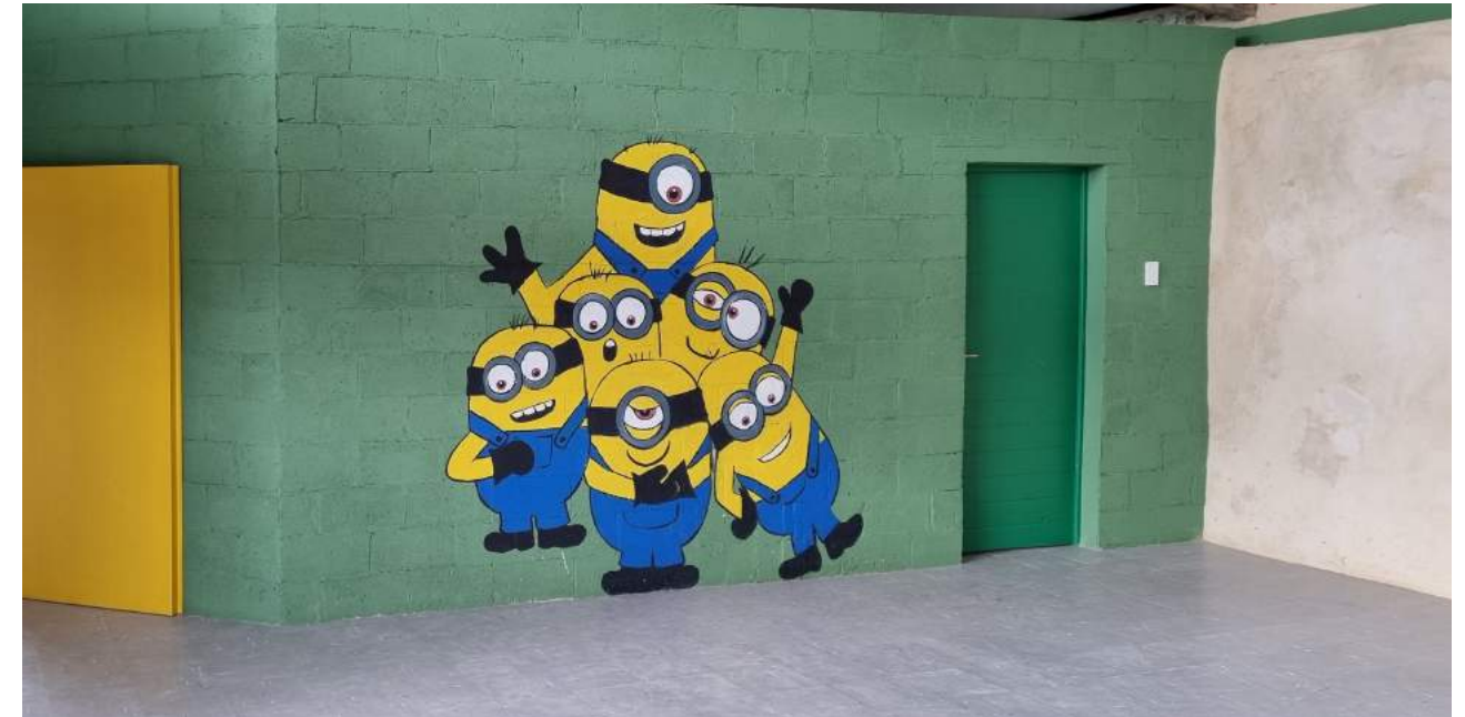
One of the internal walls made from upcycled Polyurethane film set waste

Our focus is life, occupational, entrepreneurial skills development & In-service training - employment creation & career path development. Polyurethane has long been one of the largest contributors to - waste to landfill - generated by the film industry in Cape Town. After much research and in search of a solution to this waste stream, GREENSET, funded by Raised by Wolves S2(HBO) , partnered with Envirolite to build a prototype machine that could recycle the Polyurethane into an aggregate that could be used in the manufacturer of Envirolites lightweight building blocks. Using the prototype machine, Envirolite produced 1600 building blocks made of recycled set waste which were donated by Netflix for use in the Uthando Ulwazi Educare centre in Delft Cape Town."