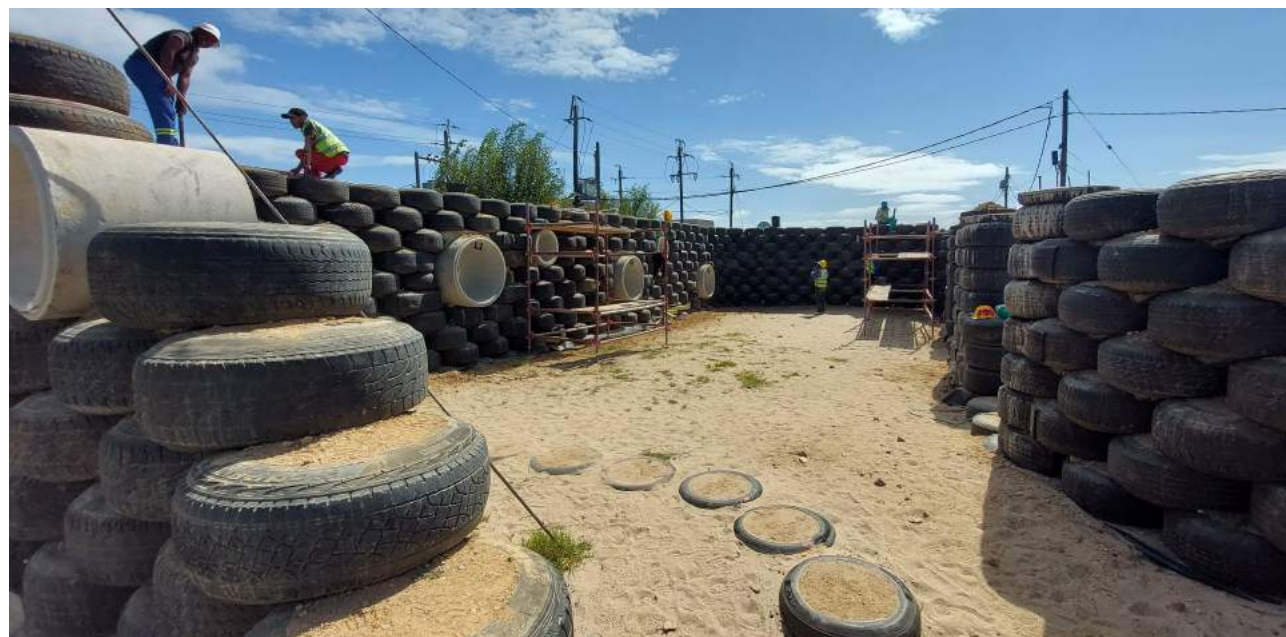
Ulwazi Educare – October 2021

In South Africa, there are approximately 4 million children under the age of 7 that are not attending a pre-school or Early Childhood Development Centre “ECD”. Likewise, millions of children are attending ECDs that are poorly built as informal structures, with limited access to toilets and basic facilities conducive to a quality education.