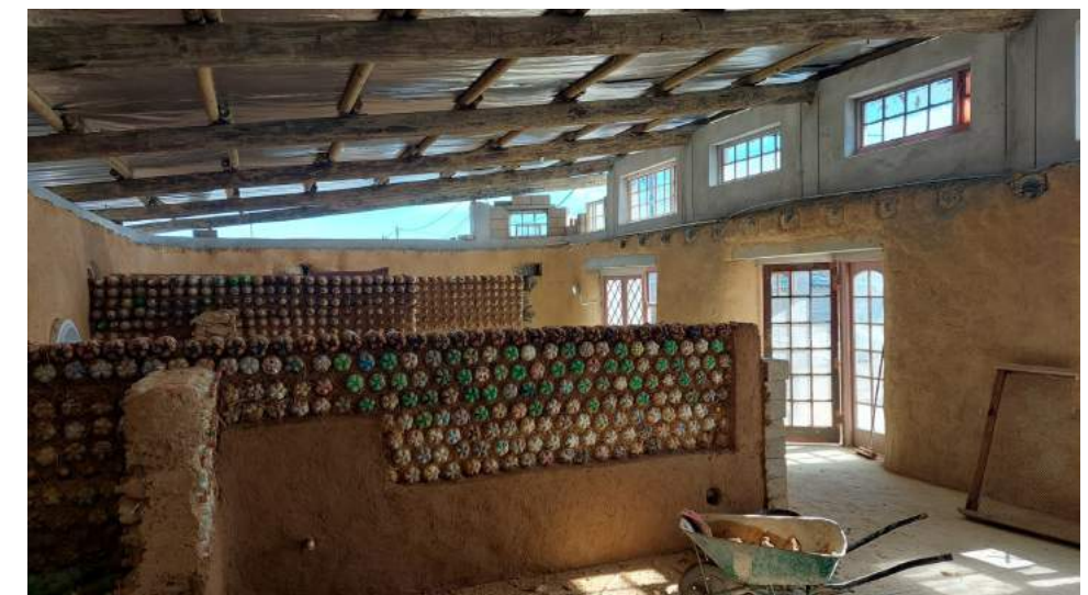
Internal walls made from ecobricks