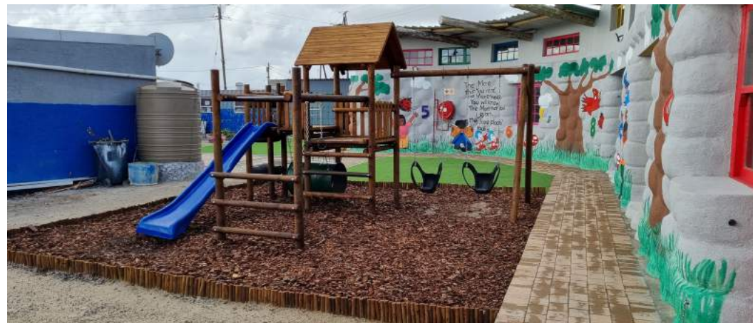
Thank you to Eunoia E.V (Germany) for donating the jungle gym