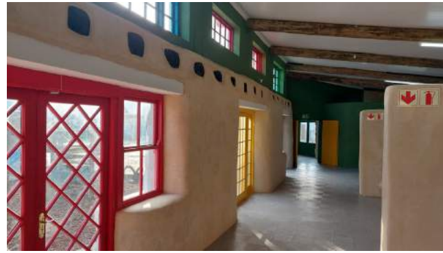
Ulwazi Educare is a work of art