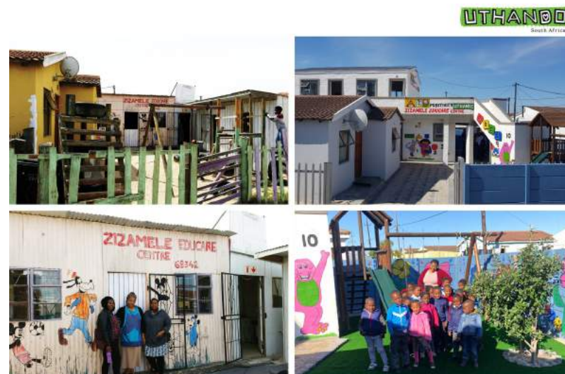
Zizamele "Just do it" Educare