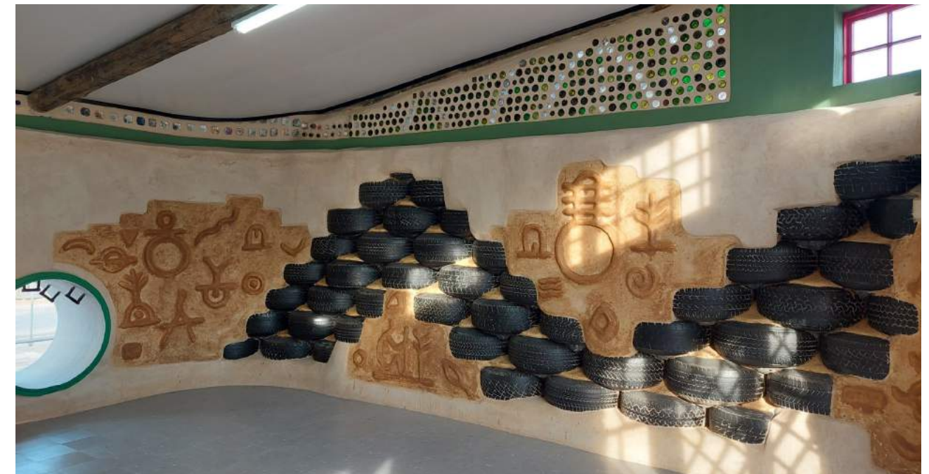
Ulwazi Educare, wall construction, cob packout, ecobricks and lots of diverse beautiful art

Sustainable building refers to the use of materials in the building process that is locally sourced, natural and kind to the environment. Sustainable buildings typically produce much of their own energy through the smart use of materials and combination of passive design features to enhance insulation and thermal mass properties. In this way, buildings are more sustainable as they have a lower carbon footprint, not only during the building process, but for the duration of its lifespan. By their nature, these buildings have a more positive social impact as they do not rely on purchasing materials with a high embodied energy, thus contributing to local job creation and training.