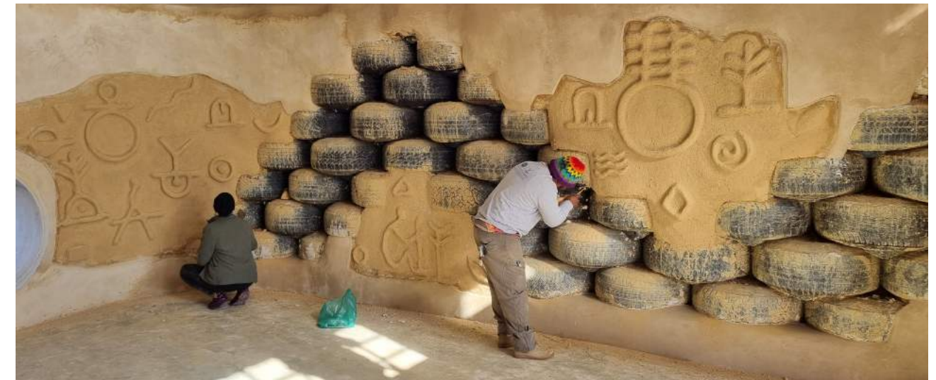
Andile creating art on one of the internal walls

Ulwazi Educare is truly blessed to contain the artistic symbols created by Andile Dyalvane.