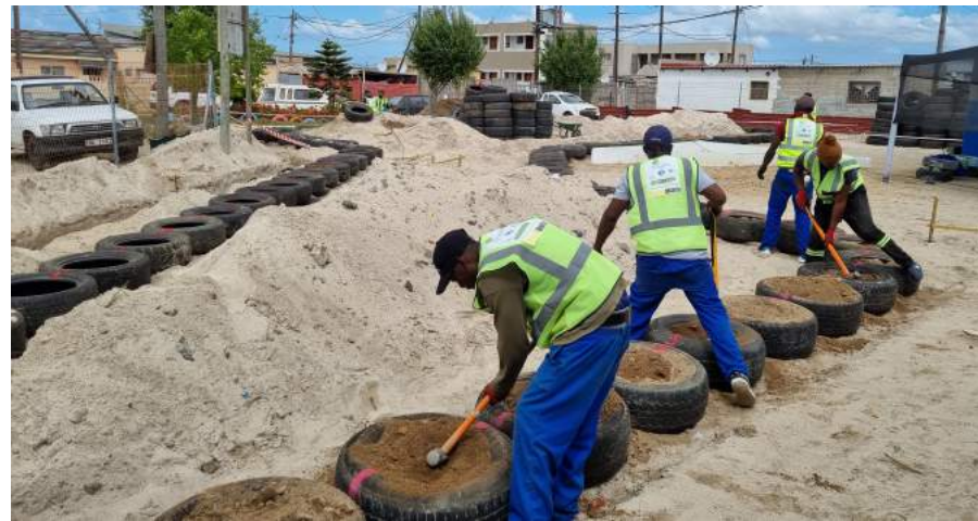
Laying the foundations