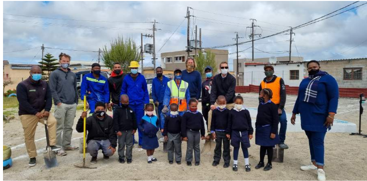
All of the stakeholders