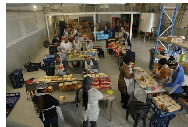
Mother City Kitchen

GCU has positively impacted the lives of many thousands of children and individuals through their various programmes. Including literacy and education advancement, physical education and sport, youth employment and empowerment. They have also provided food for the hungry, by serving as many as 12 000 soup meals per day, through the "Mother City Kitchen" initiative.