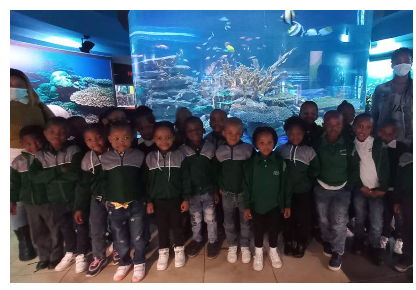
The children from the Thokozani Together Centre

"Thank you for such a beautiful blessing for the children of Ulwazi Educare. We always encourage our children to dream, and what better place for them to dream than at the aquarium."