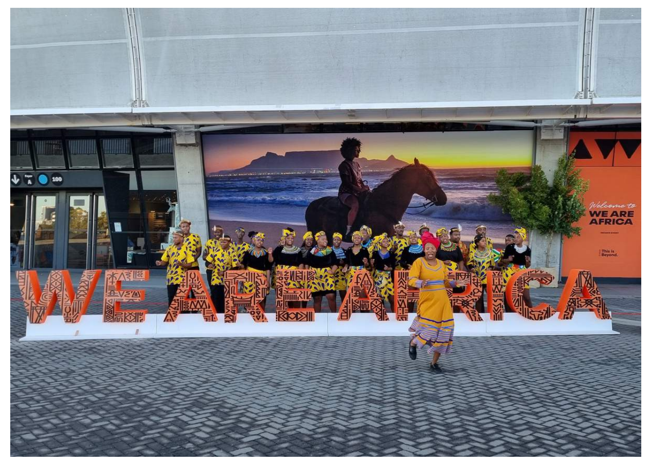
The Isibane se Afrika "the Light of Africa" Choir

Founding Director, Uthando (Love) South Africa