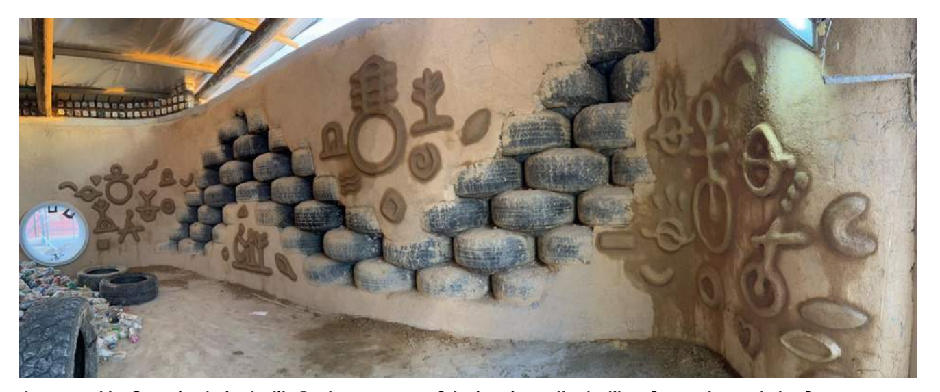
Art created by Ceramics Artist Andile Dyalvane on one of the interior walls. Andile refers to the symbols of peace, love and unity as 'Ancestoral Dreamscapes"