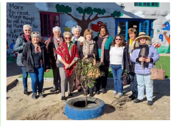
The garden group planting a tree at Ulwazi Educare

Thank you, Uthando, for an outstanding day."