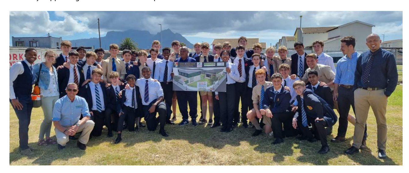
The "Big Ideas" Bishops boys and teachers

On the 9th of November 2022, Uthando hosted the "Big Ideas" group of sixty boys and five teachers from Bishops Diocesan College. Bishops is one of the most prestigious private schools in South Africa and the visit was geared towards inspiring the boys with the "Massive Idea" of starting a real building revolution in South Africa by supporting the Goal50 Edu Hub pre-school.