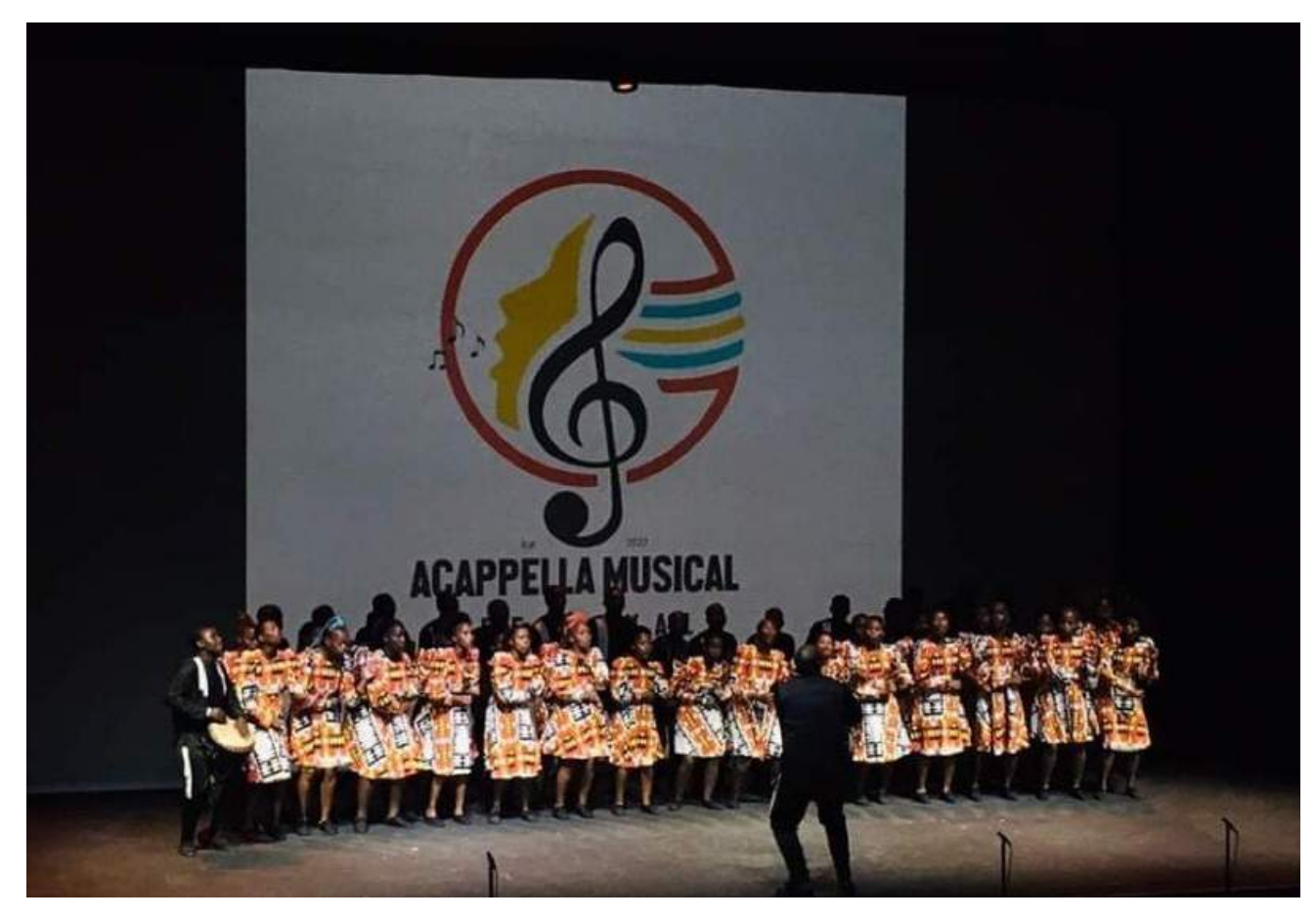
The Khayelitsha Youth Choir

be part of their long-time project. We really appreciate the introduction to the tourism industry. Hopefully we will heal and bring back joy to all those who lost hope. Have a blessed day we love you."