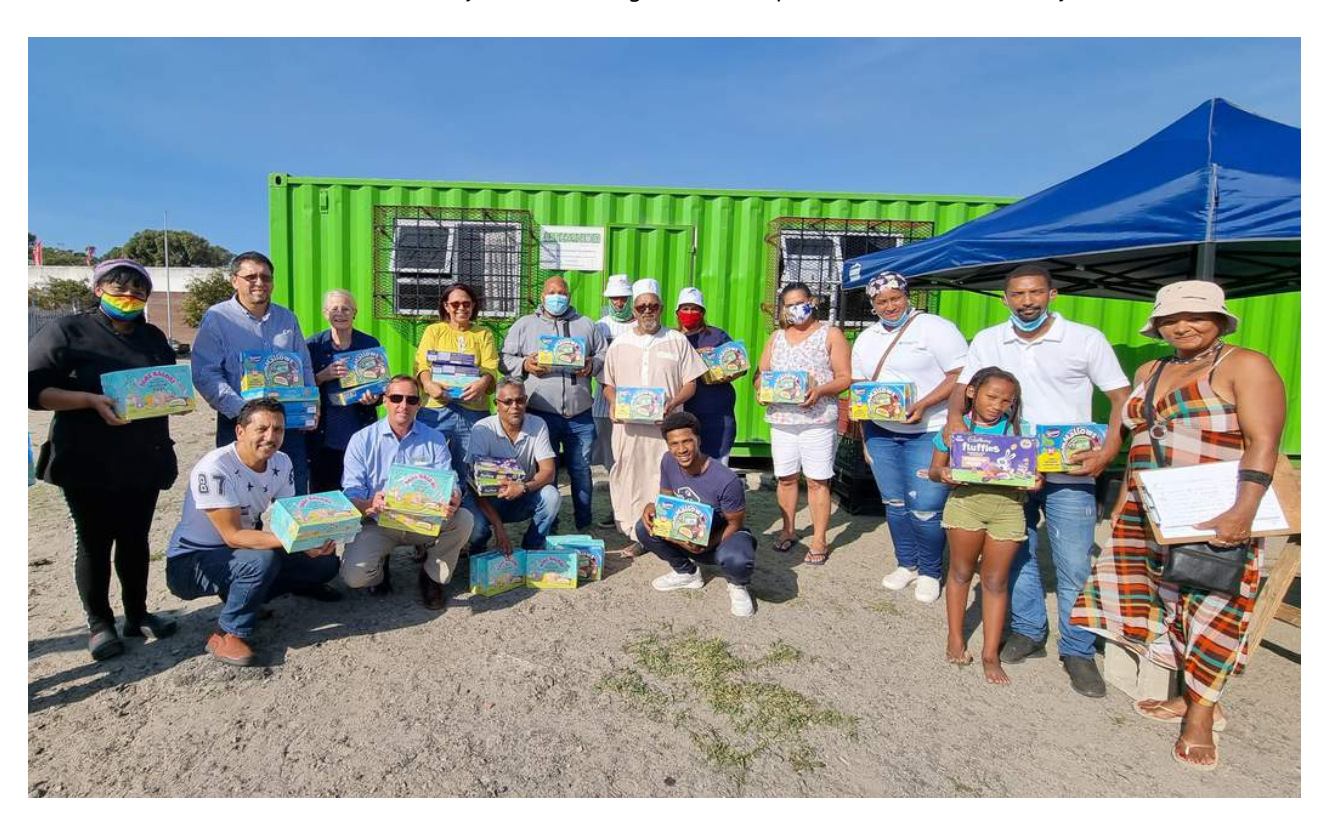
Easter eggs handed over by Uthando to various community partners in Hanover Park

2023 was the 4th consecutive year that Uthando ran an Easter egg drive for the children of Hanover Park. With donations flooding in from South Africa and across the world, Uthando was able to deliver more than 14 000 easter eggs which were distributed to every corner of Hanover Park, a community ravaged by gangsterism and violence, and where the children truly deserve as much cheer as they can possibly receive. Some of the eggs also went to children in the community of Manenberg and St Joseph's Home for Chronically Ill Children.