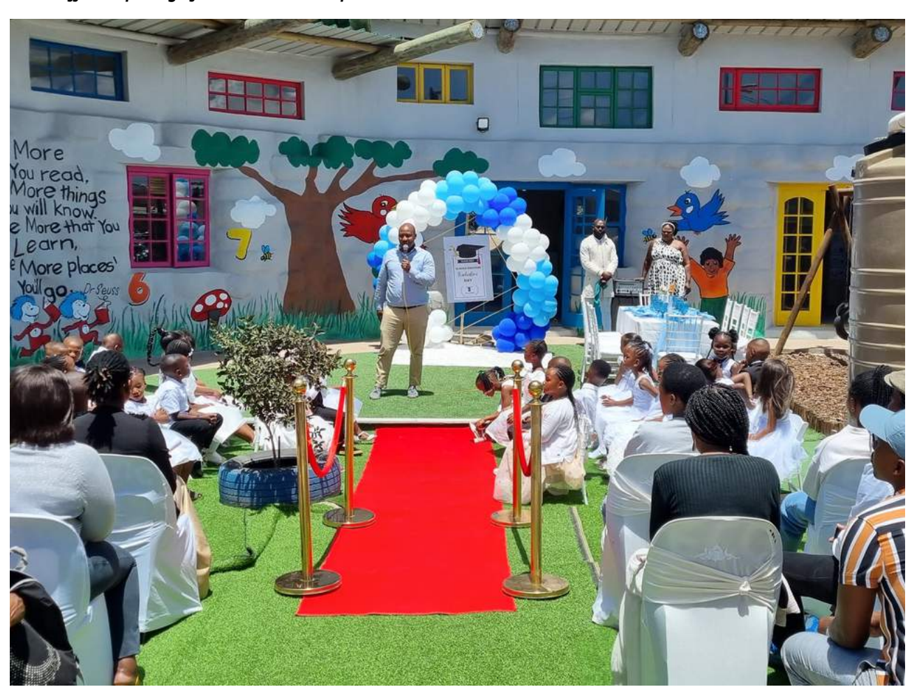
First graduation of Grade R students in December 2022