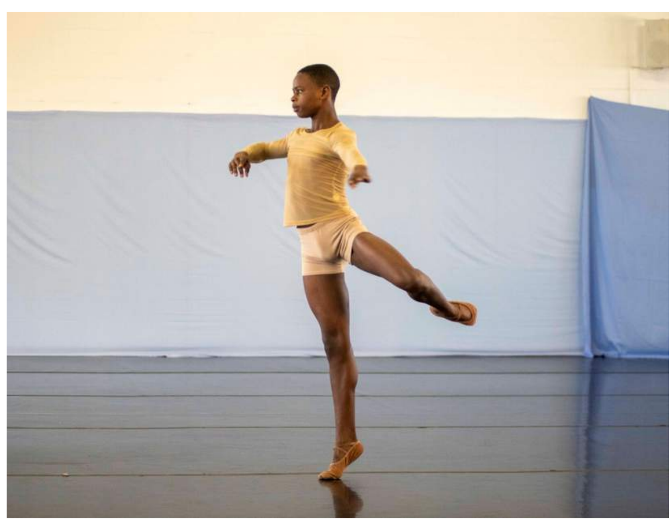
Zama Dance School

THANK YOU to our kind, generous and thoughtful donors and benefactors from South Africa and all around the world for your kindness, thoughtfulness and support. We love and appreciate you!