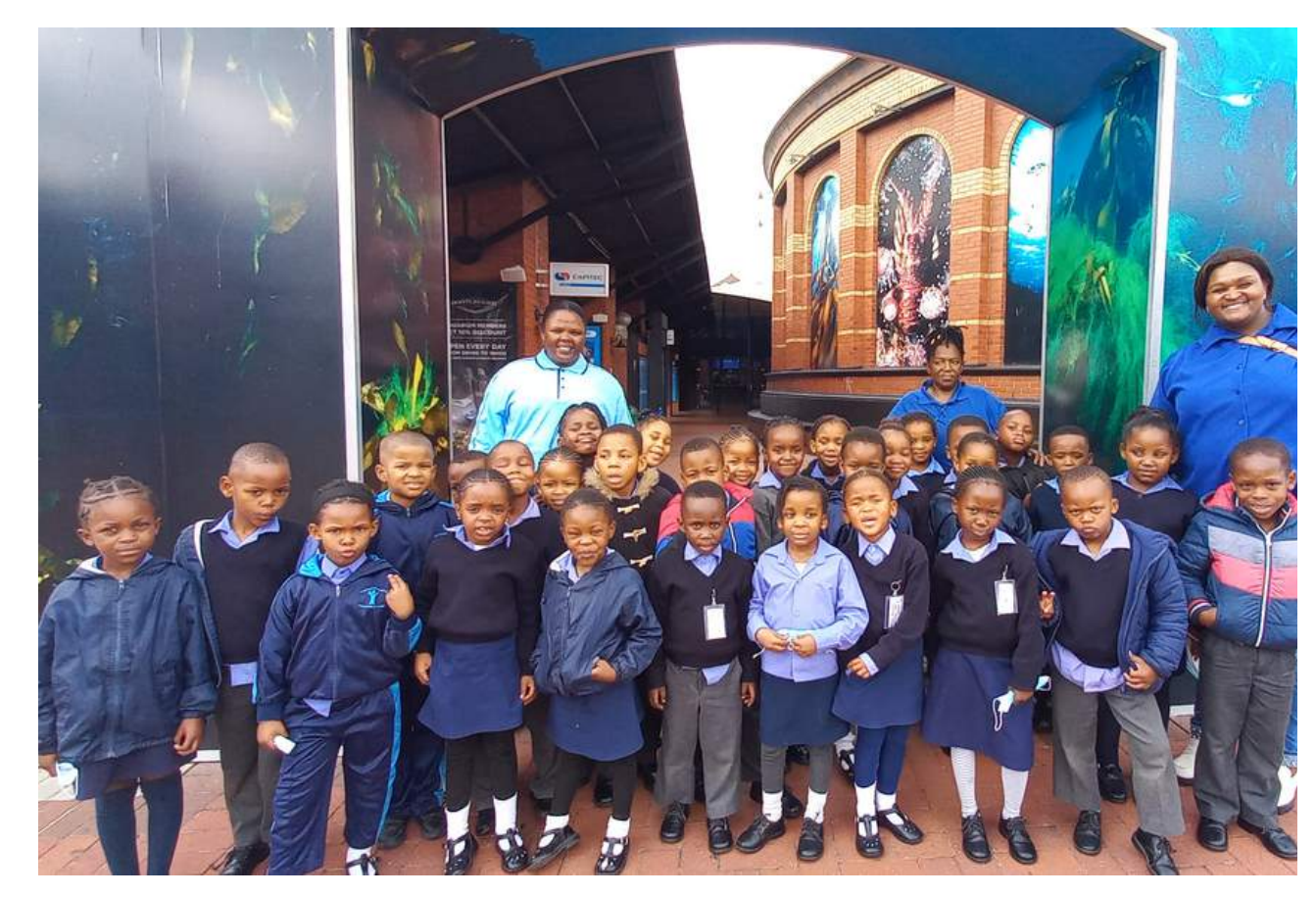
The children from Ulwazi Educare