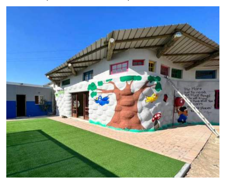
June 2023 Installation of the astro turf