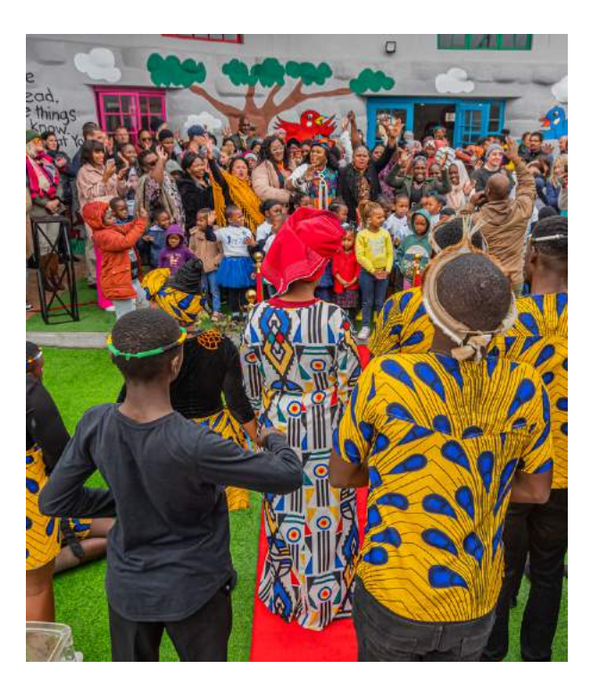
Grand official opening of Ulwazi Educare September 2022