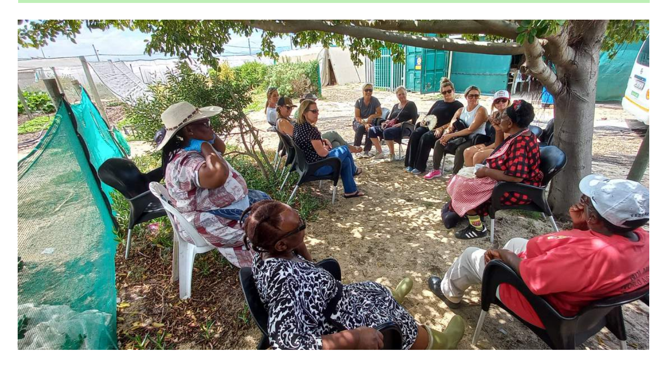
The women in quality conversation sitting under the tree at the Moya We Khaya Garden in Khayelitsha

Incredible!!! Beyond our expectations. It just got better and better. Thank you, thank you, thank you." "Thank you for sharing the hopes and dreams of change makers in these communities that you support."