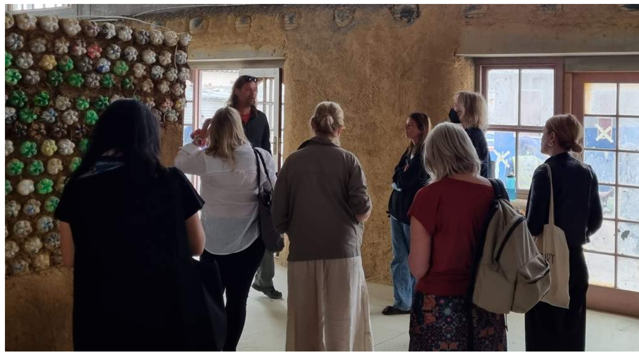
Press trip journalists listening to the builder at Ulwazi Educare Centre. The school is being built out of tyres and recycled materials.