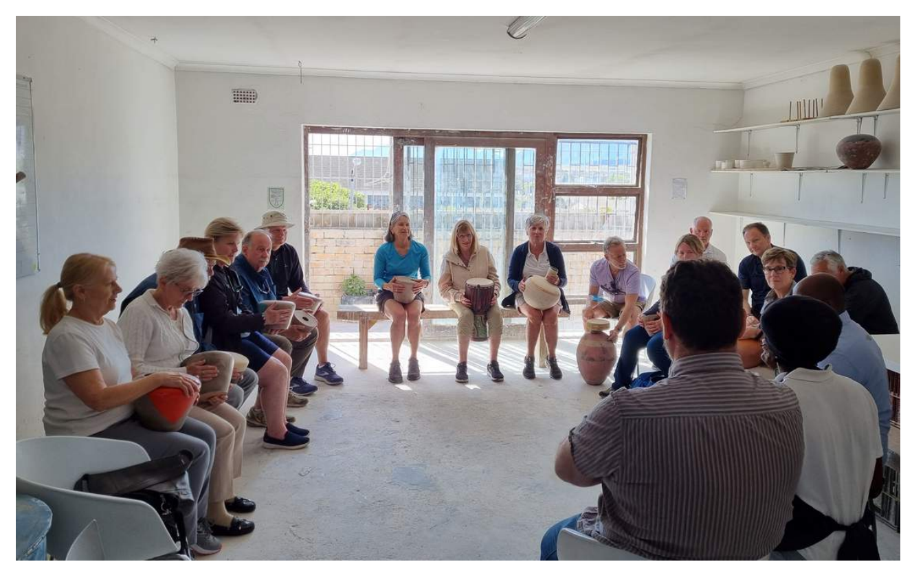
The group playing music on pottery drums

We were inspired by the initiatives aiming to empower people from the bottom up, whether teaching skills, providing educational opportunities or even supporting local art programs. As they put it on their website...'Motivated by love, compassion and respect for our common humanity, Uthando (Love) South Africa seeks to form part of the solution' to meet the challenges faced by those living in extreme poverty.