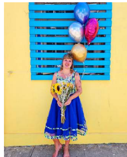
Brave Rock Girls