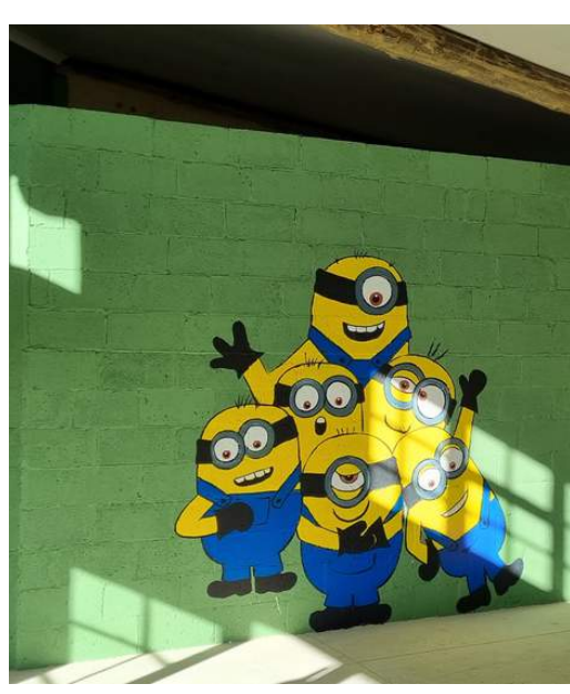
One of the interior walls in Ulwazi Educare