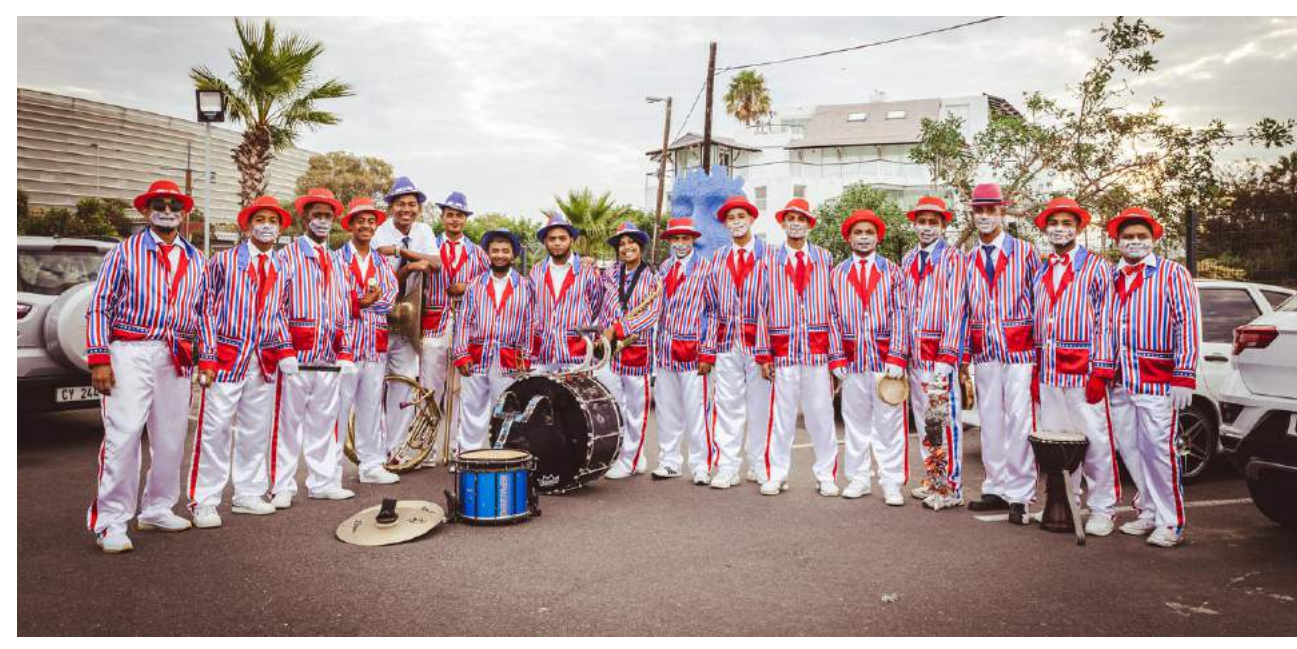
The Tjommies from Hanover Park at the official opening of We Are Africa

We Are Africa sincerely believes in community, sustainability and giving back. For We Are Africa it is not just words. The 150 trees that were used at the show were planted after the show by delegates together with the children and staff at Christel House School, a non-profit school which Uthando supports. In one day, the school was blessed with an instant forest of decent sized indigenous trees.